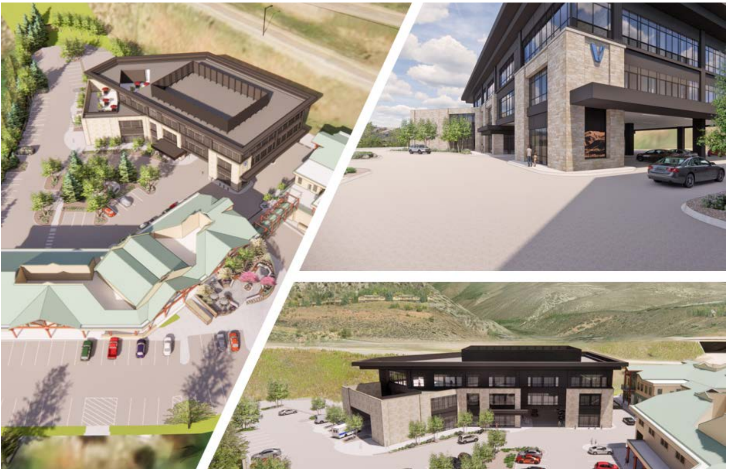
RENDERINGS OF THE PRECOURT HEALING CENTER, EXPECTED TO OPEN IN 2025.

To address this need, Vail Health and Eagle Valley Behavioral Health (EVBH) created the Edwards Community Health Campus, centrally located in Edwards, Colorado, for all Vail Health Behavioral Health providers and behavioral health services. The Wieggers Mental Health Clinic opened in early 2023, offering intensive outpatient behavioral health services. The Precourt Healing Center, an inpatient behavioral health facility, is scheduled to open in 2025. The campus is also home to community partners like My Future Pathways and the Eagle Valley Community Foundation's Community Market.