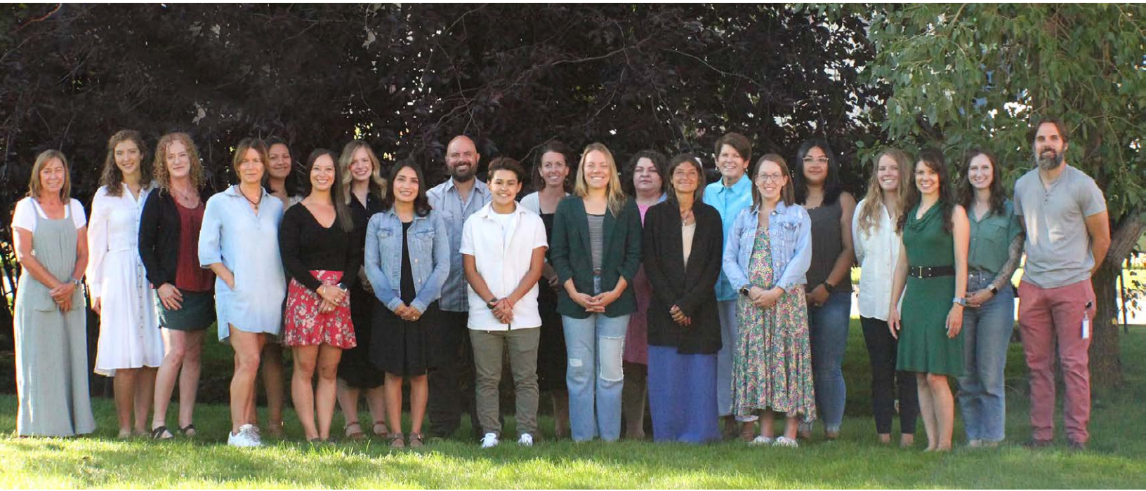
YOUR HOPE CENTER'S SCHOOL-BASED CLINICIANS