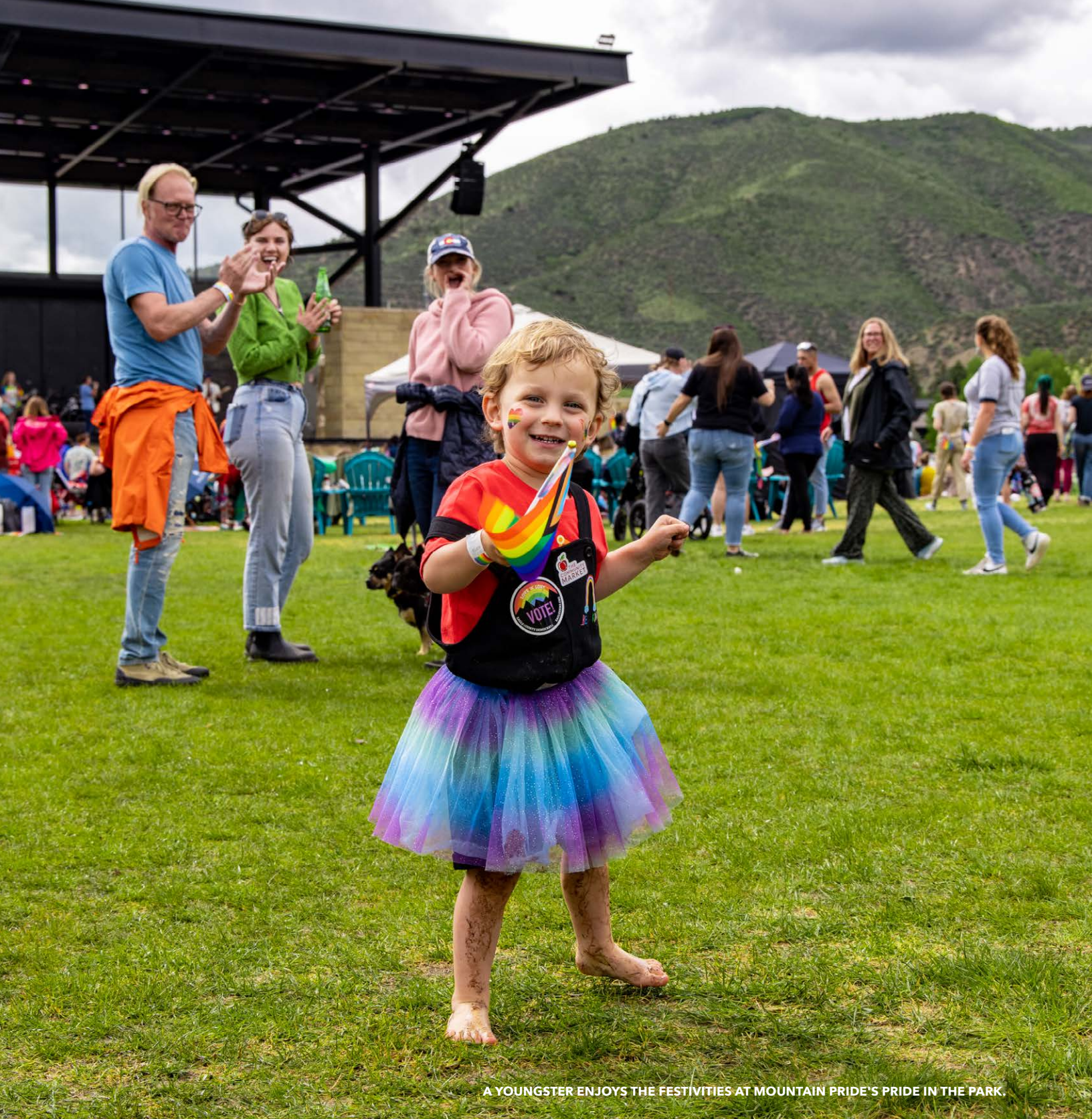
A YOUNGSTER ENJOYS THE FESTIVITIES AT MOUNTAIN PRIDE'S PRIDE IN THE PARK.