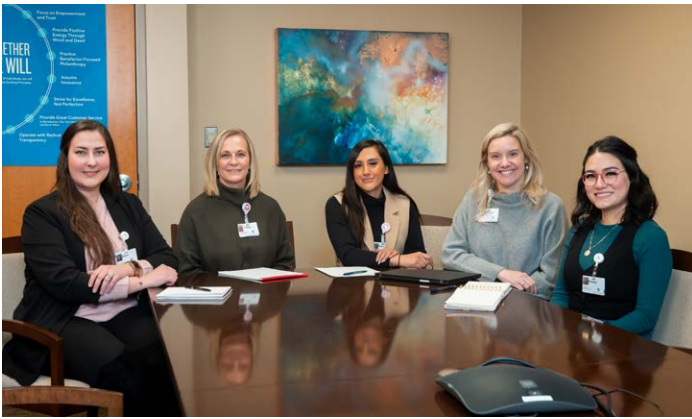
VAIL HEALTH CASE MANAGEMENT TEAM

The case managers are bilingual and bicultural, making engaging and building trust with primarily Spanish-speaking clients easier. They serve clients of all ages and offer various case management and care coordination services, including short intervention, stress management, and community resource navigation. The support provided by the GE Johnson Foundation has had an immediate impact on the level of care that case managers can provide.